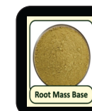
Root Mass Base