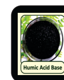
Humic Acid Base