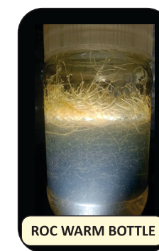
ROC WARM BOTTLE